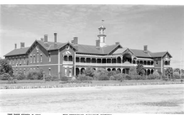
The Orphanage, Ballarat