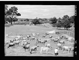
Ballarat, Orphanage Farm, Cows in Field