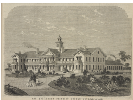
The Ballarat District Orphan Asylum