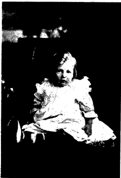
Who will adopt this Little Chap?

Description: This image appeared in the Methodist Spectator newspaper on 12 May 1899. 'Livingstone Home' was an early name for the Methodist Homes for Children in Cheltenham.