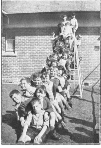
Smiles on the Slide.