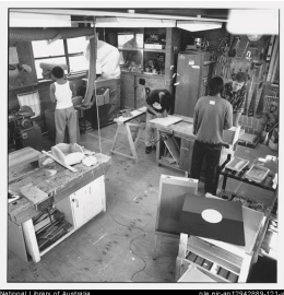
Quamby Youth Detention Centre, Symonston, Canberra - residents and instructor in industrial arts room