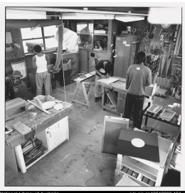
Quamby Youth Detention Centre, Symonston, Canberra - residents and instructor in industrial arts room